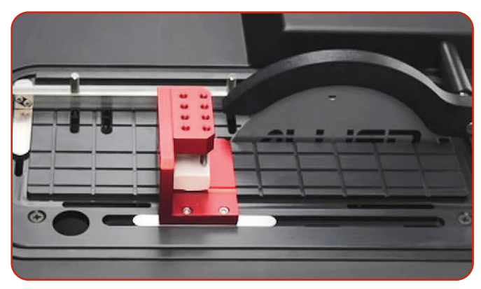
Table slot to guide fixtures for linear cutting