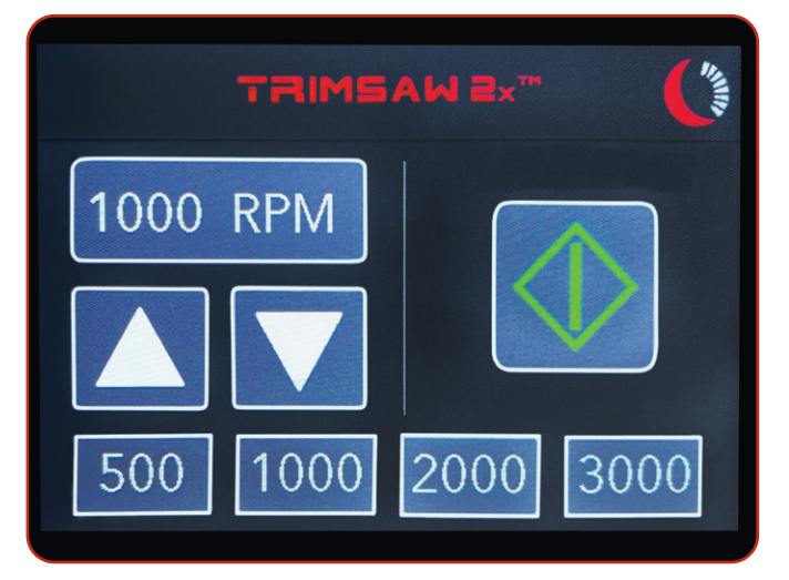
The 3.5" color LCD touchscreen is used to control all functions and is extremely easy to navigate, allowing greater efficiency among users.

Dims. 18" W x 20" D x 11" H (457 x 508 x 279 mm) Weight: 35 lb. (15.9 kg)