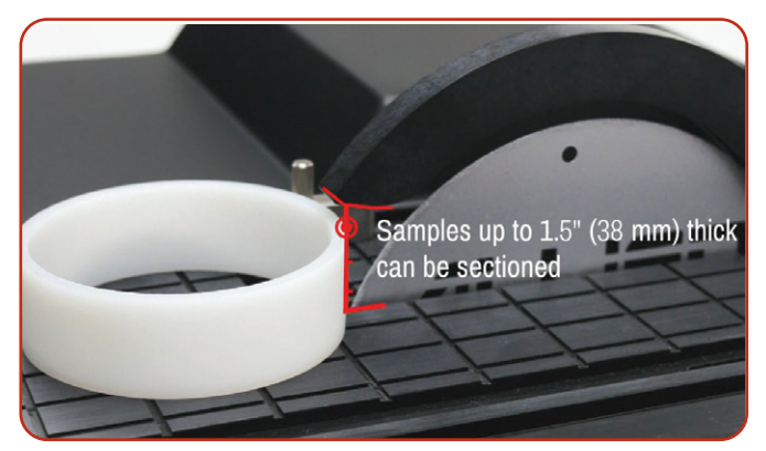
Adjustable blade guard for thick samples