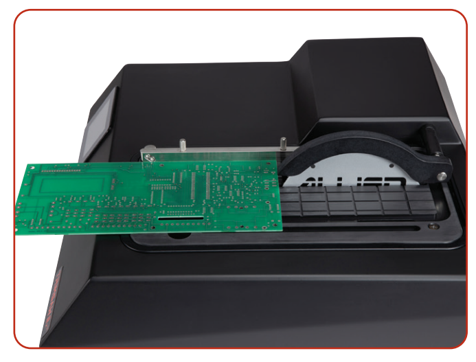
Adjustable table rip fence for measured/guided sectioning